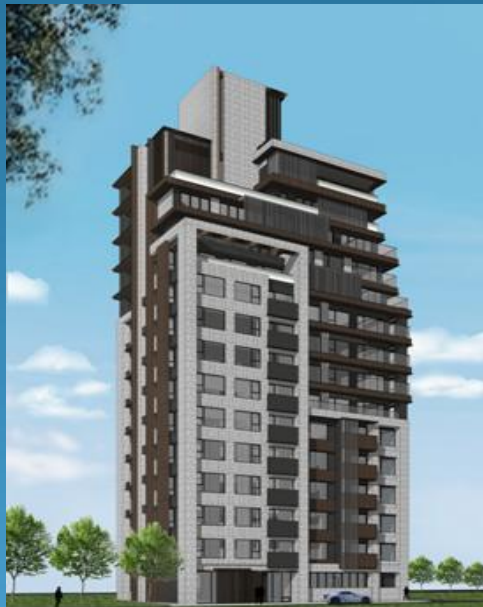
Ta Jiang Tianmu Project

Presentation for Investor Conference December 13, 2024